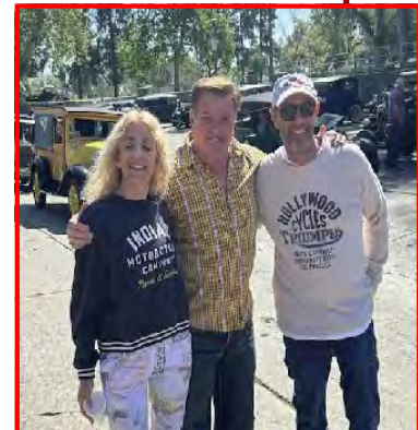
Customizer Chip Foose "cruising" with his Friends.